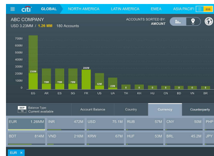
Filtering balances by currency