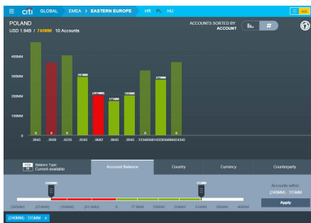
Filtering balances by amount