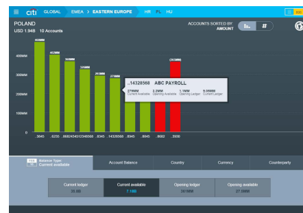
View balances in a country